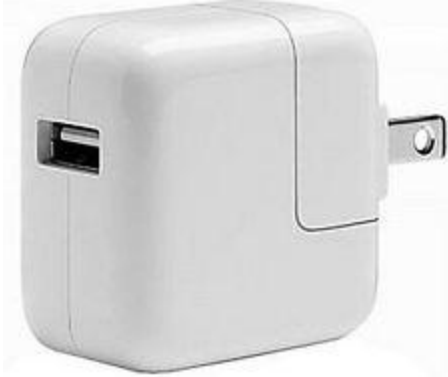
Apple 12W USB Power Adapter: