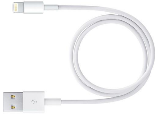
Apple Lightning to USB Cable: