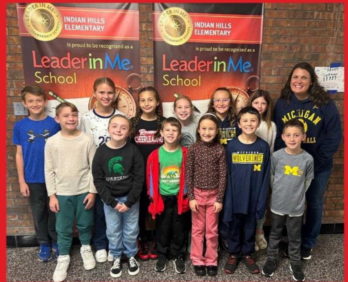
23-24 Lighthouse Team