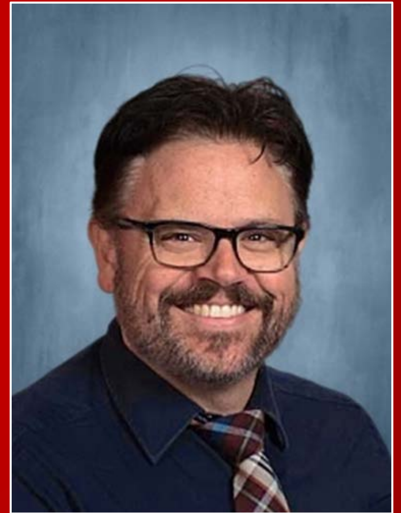
John Phillips Romeo High School