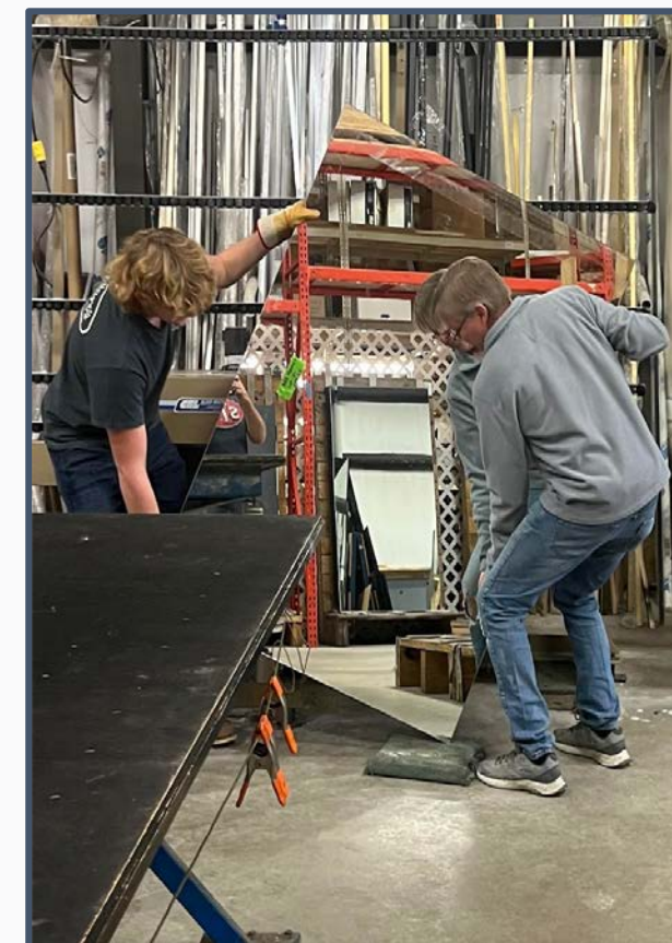
Rocco Shower Builder NuWay Kitchen & Bath