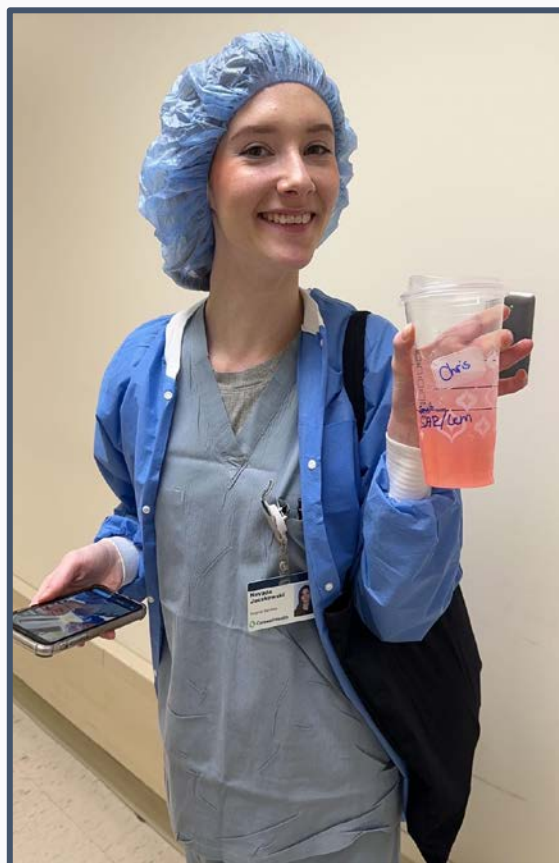
Nevada Central Sterile Processing Corewell Health